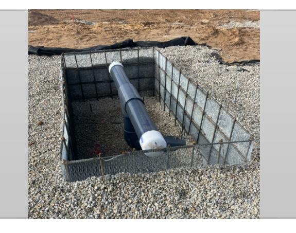
Drain basin awaiting drains to be delivered