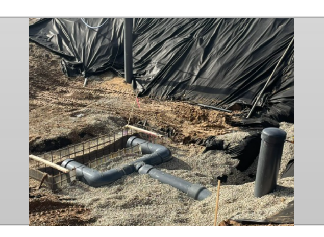
Deep end main drain system being run and clear stone installed